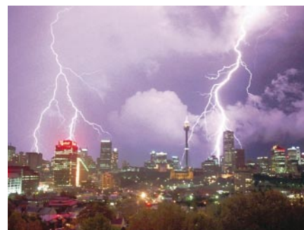
Bright sparks: simulating storms using the new machine will require refined convection models.

By the late 1990s, Japan was looking for ways to help its struggling vector supercomputer manufacturers. A vector-based climate machine was an obvious choice. Climate researchers had not willingly abandoned vector machines, as it is difficult to adapt some climate models so that they run efficiently on parallel systems. And with a relatively weak base in climate science, the